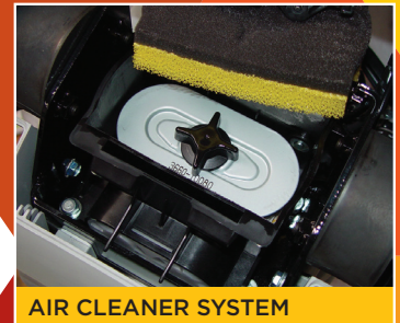
AIR CLEANER SYSTEM