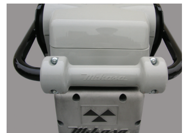
EASY LOAD HANDLE ROLLER