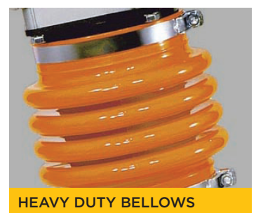
HEAVY DUTY BELLOWS