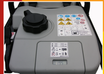
3-LITRE FUEL TANK