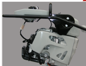
VAS ANTI-VIBRATION SYSTEM