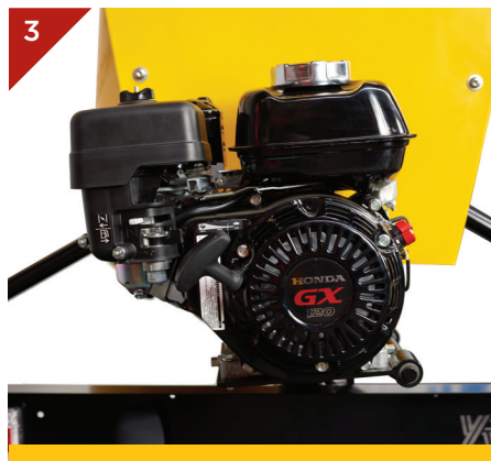
Honda GX120 Engine