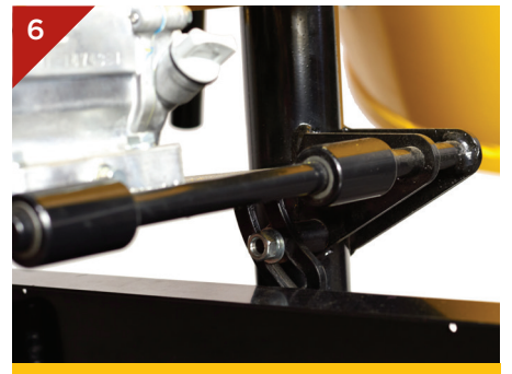
Simple Belt Tension System