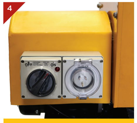
Or Electric Option 240V Single Phase