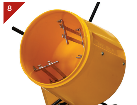
Polyethylene Bowl Option