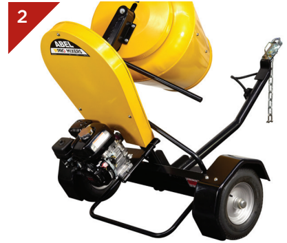
Rear Tip-Over Protection