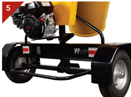
LED Lights & Number Plate Lights Standard