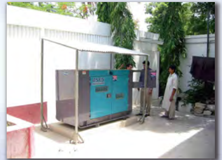
As the Emergency power source in the hospital.