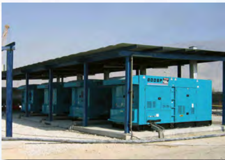
As the power source in the area where electricity is unavaible.