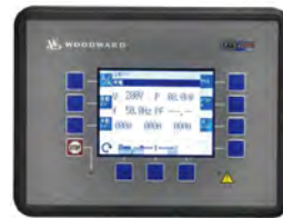
EASY GEN 3500

(4) Fully Automatic Parallel Operation Device "EASY GEN": High-speed digital control enables all operations from starting and stopping to synchronization verification, synchronization activation and load sharing to be performed at the touch of one button. This device has multiple functions that enable parallel operation of generators with differing capacities, the number of units being operated to be controlled and other operations.