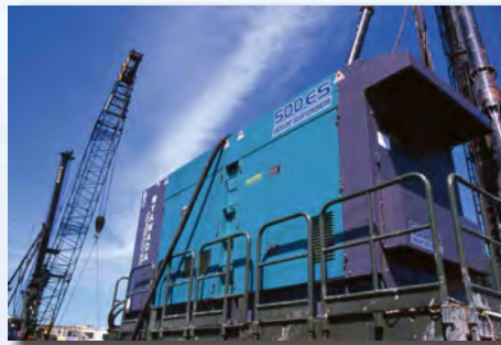
As the power source in the construction site.